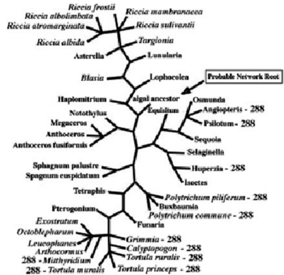
FIG. 1. Mapping of Tr288 orthologs to an unrooted phylogenetic network of a basal portion of land plant phylogeny (synthesized from several previous studies, published and unpublished). Those genera whose names are in italics have been classified as desiccation-tolerant according to reports in the literature, see Proctor and Pence (2002), and from unpublished observation (Oliver and Mishler).

The apparent emphasis on the synthesis of LEA proteins during the initial periods following rehydration of dried gametophytes and the possibility that they play a role in membrane stability or reconstitution suggests that these genes may play a key adaptive role in the evolution of desiccation tolerance in plants. In order to gain some insight into this possibility, we utilized the conserved nature of the nucleotide sequences corresponding to the 15 amino-acid repeats within the Tr288 gene to develop a PCR-based strategy to identify possible Tr288 orthologs in a wide range of land plant species. The purpose of such an investigation was to determine the evolutionary relationship of the Tr288 gene to desiccation tolerance. This approach is limited by the ability of the PCR primers to allow amplification of a fragment from the ortholog and any conclusions that are drawn are done so under the caveat that the absence of a PCR fragment may simply mean that the primer was incapable of allowing extension of a DNA product because of a mismatch at the 3' end. To alleviate this problem, at least in part, we chose the most highly conserved sequence within the repeats for the 3' portion of the primers and cloned and sequenced each PCR product to be sure that it